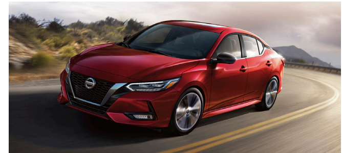
3. Lease your new vehicle.

This is a summary of the Lease Wear & Tear contract. Please refer to the actual contract for additional information including details of the benefits, terms, vehicle eligibility, conditions, limitations and specific exclusions that apply to this product. Maximum eligibility limits apply.