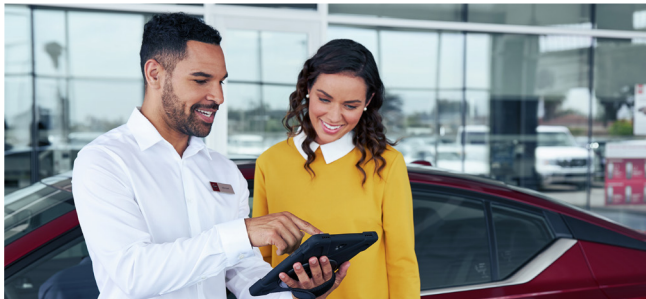
1. Turn in your vehicle when your lease expires.