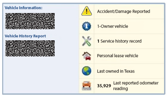
Sample Vehicle History Report showing an accident with damages.