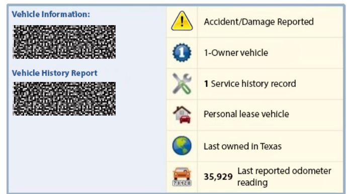
Sample Vehicle History Report showing an accident with damages.